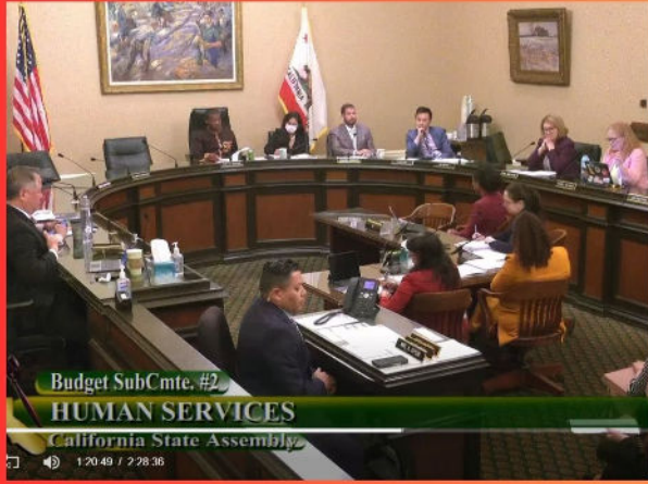
May 22nd - California Assemblymembers join the Budget Subcommittee on Human Services to voice concerns & opposition to proposed child welfare cuts

On May 22nd, several Assemblymembers joined the Budget Subcommittee on Human Services hearing to speak out against the numerous #CABudget cuts proposed by the Newsom Administration to human services programs, including those serving foster youth. Thank you California Assembly for standing with foster youth! #notthesecutsnotthesekids