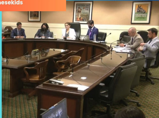
May 22nd - California Assembly Budget Subcommittee on State Administration discusses the proposed elimination of the $13.7 million Housing Navigation & Maintenance Program serving former foster youth